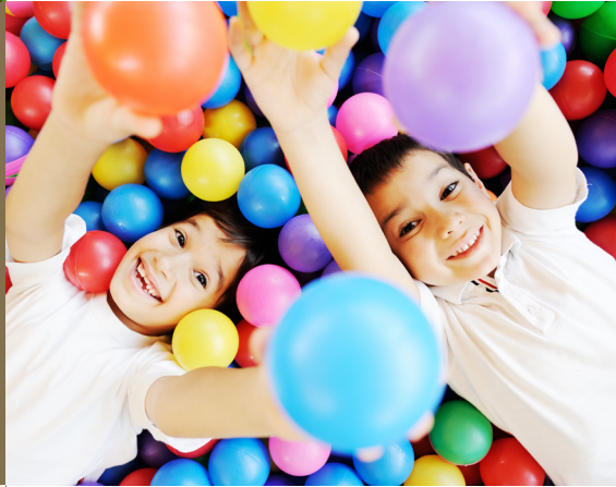
Figure Out (Kids Activities) @ 11:00a.m and Time is Ticking (Group Games) @ 05:00p.m